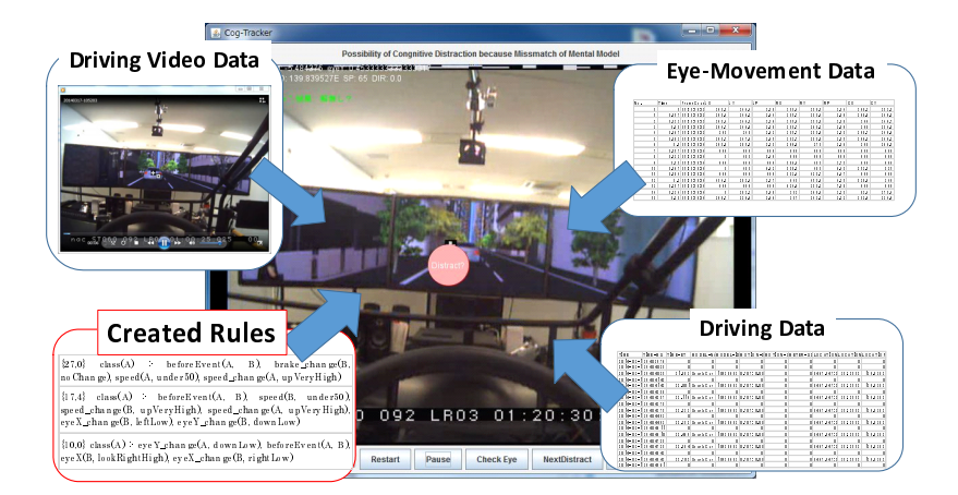
Fig. 2. GUI that enables detection distraction for driving data [4]

and driving data by ILP. We assigned a mental arithmetic task to the research participants to cause cognitive distraction and then learned the rules of the cognitive distraction using the cognitively distracted state as positive examples by ILP. Using the generated rules, we hope to reduce car-driving risks by providing advice or urging caution using voice utterance when distracted driving is detected.